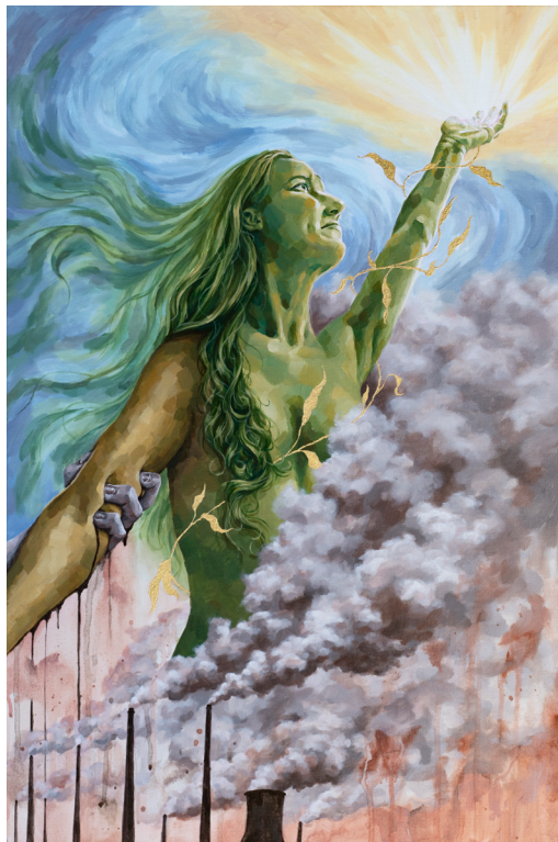
Anthropocene by Jackie Liu

The Peninsula Museum of Art is pleased to announce their new March and April exhibition, New Voices: Art from Bay Area Universities! The exhibition runs from March 12 - May 1, 2022