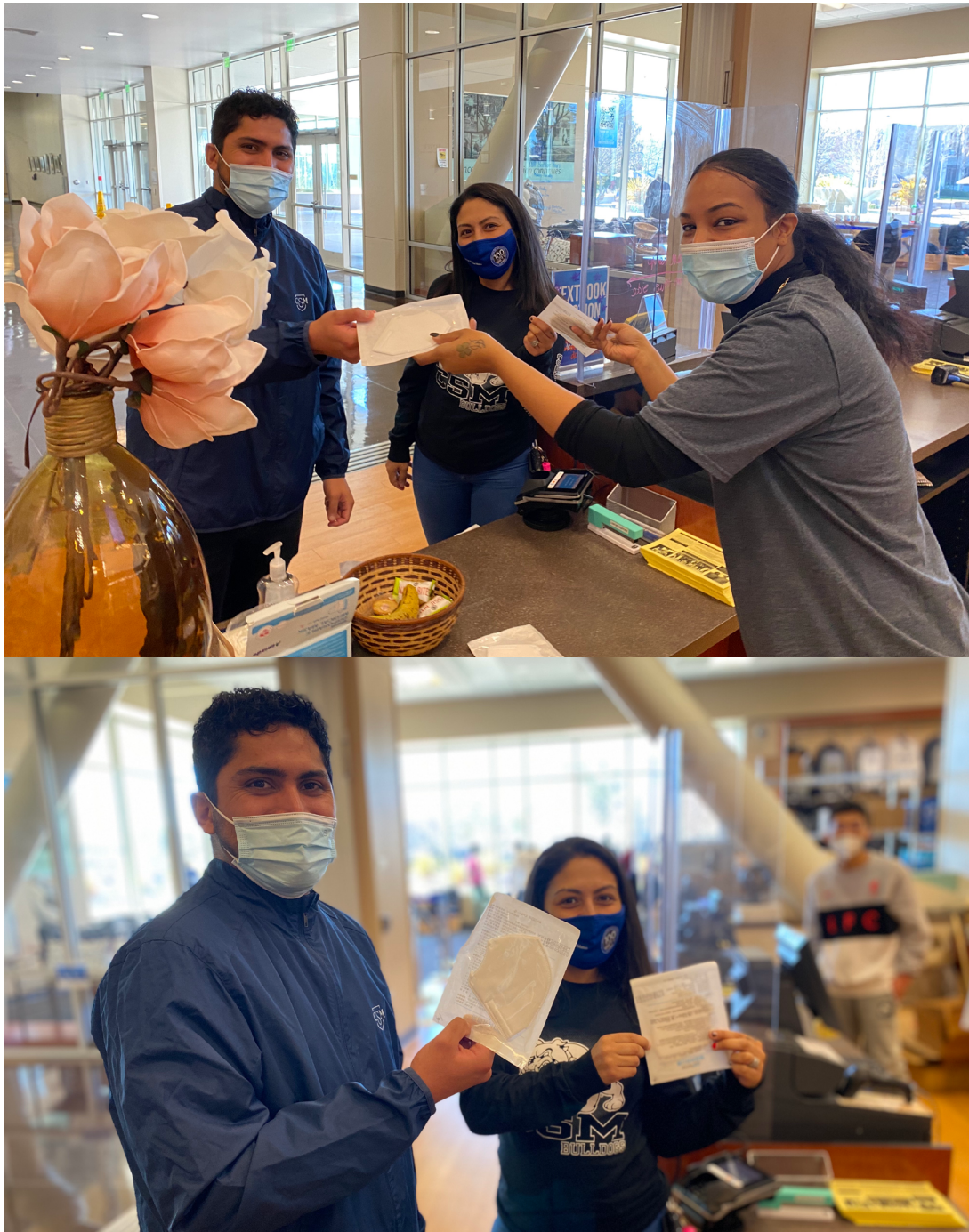
CSM students pick up their free KN95 masks at the Bulldog Bookstore.

SMCCCD continues to make face coverings (masks) available to all students. Face coverings are still required when indoors (unless actively eating or drinking) and free surgical masks are located at various locations throughout all buildings. In addition, KN95 respirators (masks) are available for free at locations throughout most campus buildings. Here is a helpful USA Today Article on reusing and storing your KN95