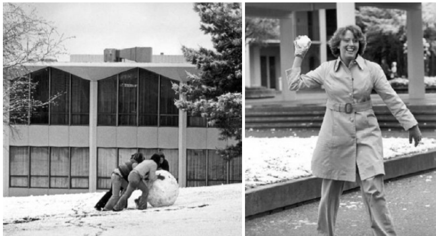
Left: Students rolling a snowball toward Building 14. Right: Taking aim.

Snow sometimes dusts the Bay Area's highest peaks, such as 4,000-foot Mount Diablo. On the morning of February 5, 1976, the College of San Mateo community woke to much more snow, much closer to home.