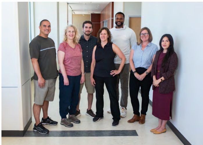
CSM welcomed new faculty hires at New Faculty Orientation.