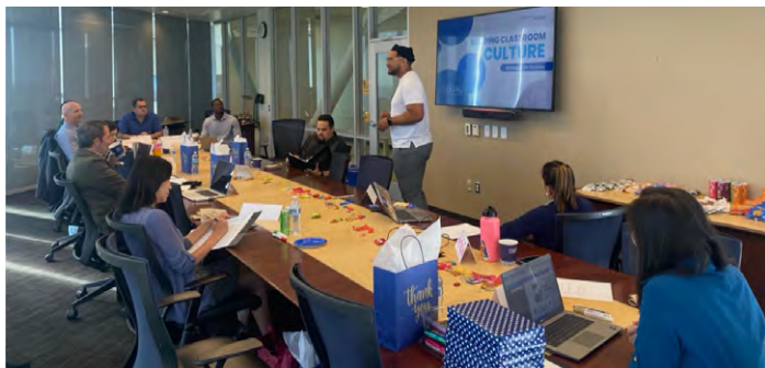
Strategies for Successful Teaching in Dual Enrollment workshop.

Participating faculty and staff are excited for the new academic year ahead and are determined and committed to building excellent in-classroom experiences and creating greater opportunities and connection to CSM for all dual enrollment students. Additionally, on Thursday, August 10, 2023, the CSM Dual Enrollment team, in partnership with San Mateo Union High School District, co-hosted our inaugural “Dual Enrollment Launch” event, bringing in CSM faculty, high school partner teachers and site administrators, and high school district partners, to kick off the new academic year together. The day was truly inspiring as attendees engaged in networking, aligning our efforts with a clear purpose, developing curriculum and programming with a focus on equity, exchanging best practices, and reinforcing our shared dedication to excellence. The CSM campus is actively working towards fostering a sense of community and exploring strategic approaches to enhance our partnerships, all centered around serving the needs of our students. We are so appreciative of the support provided by SMCCCD, CSM, and our high school partners (SMUHSD and CUSD), and are committed to continuing to grow the CSM Dual Enrollment Program and creating dynamic and memorable experiences for students.