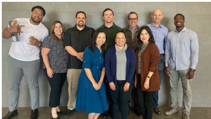
The CSM Dual Enrollment team with Dual Enrollment faculty.

On Tuesday, August 1, and Wednesday, August 2, the CSM Dual Enrollment team were thrilled to host a 2-day summer experience, "Strategies for Successful Teaching in Dual Enrollment" for our dedicated new and returning CSM Faculty who will be teaching dual enrollment courses in the new academic year.