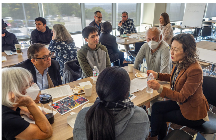
CSM faculty, staff, and administrators participate in an interactive workshop (the third in a series based on Heather McGhee’s book The Sum of Us ) focused on multi-racial coalition building during CSM’s April 2023 Flex Day morning session.

Lessons learned through this process will be reported out in statewide venues, such as the RP Group Student Success Conference; Academic Senate Plenary; CCLC Annual Conference; and the ACCCA Conference.