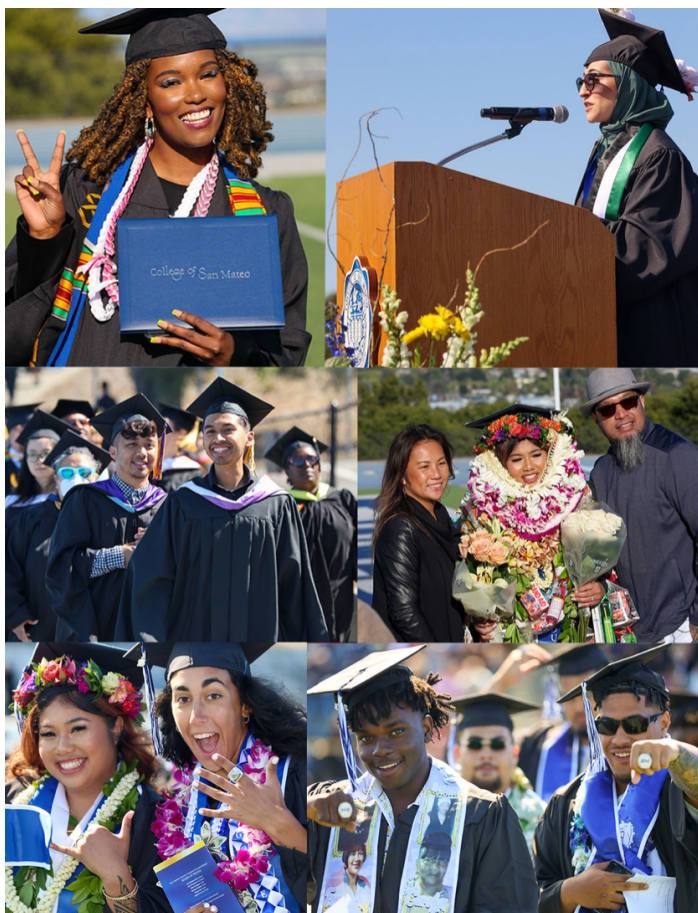
Images from College of San Mateo's 2023 Commencement.