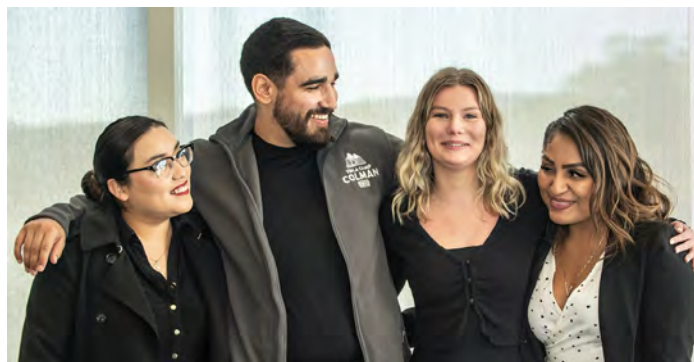
CSM Project Change student alumni panel.

College of San Mateo's Project Change Learning Community has positively transformed the lives of juvenile justice-impacted youth on the campus for many years. Project Change provides wrap-around student support services, direct access to postsecondary education for incarcerated youth, and in-person college instruction inside juvenile youth facilities. CSM's Project Change was the first community college-supported program of its kind in California, but it will no longer be the only one.