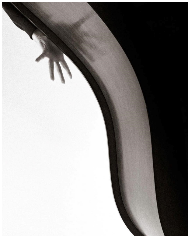
Digital Photography by CSM Student Hoang Trinh

Avenue 25 Gallery has organized an exhibition of photographs in collaboration with the Photography Department of the College of San Mateo. The exhibit is on view at Avenue 25 Gallery through April 12.