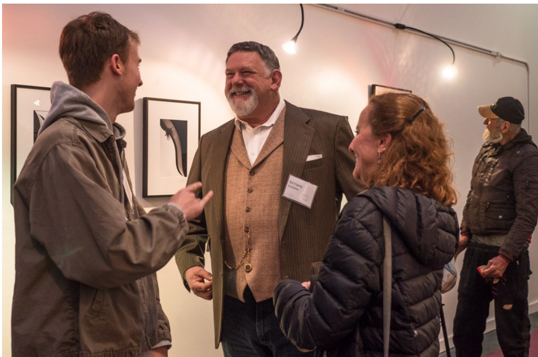
Students, family members, faculty and community members mingled at an opening reception for the exhibit on March 8.