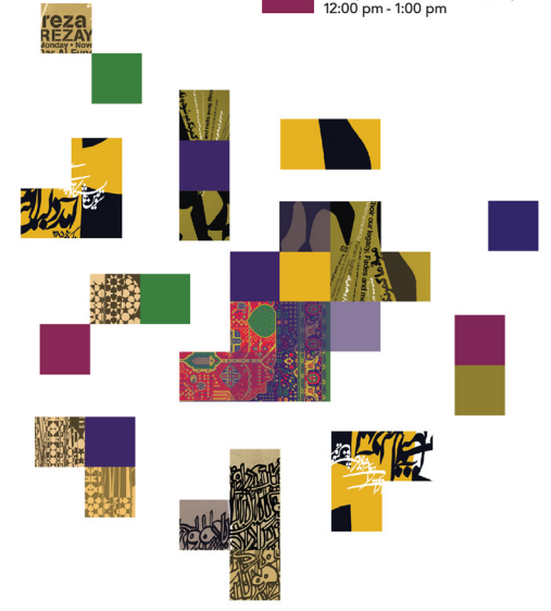
Promotional exhibit poster created by digital media student, Marine Kazaryan

April 16 – May 19, 2018 Reception at CSM Library: April 23 12:00 pm - 1:00 pm