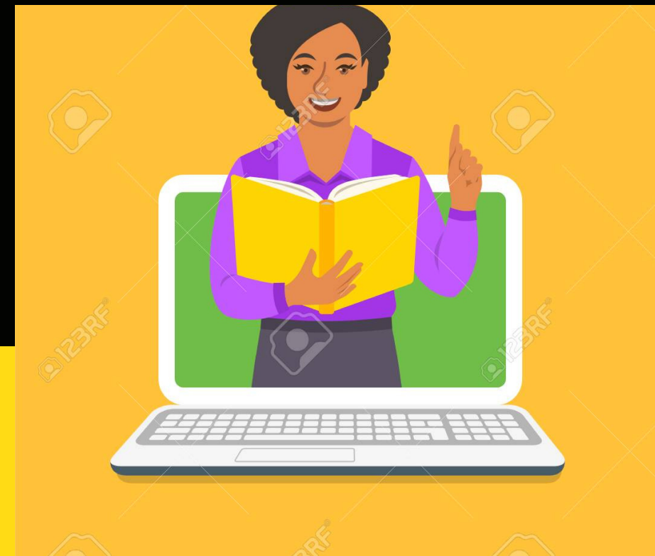
Class - Author lectures