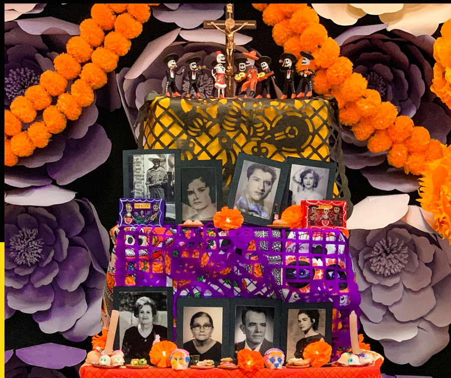
Día de Muertos