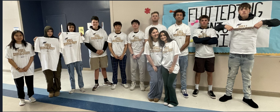
Hillsdale HS: ADMJ 102 Seniors T-shirts to celebrate Class of 2024 CSM Faculty: Ed Barberini