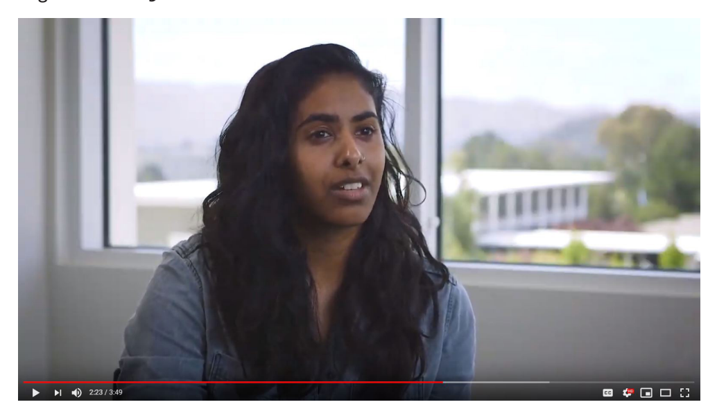
CSM has also produced a new introductory marketing video, viewable on YouTube: <a href="https://www.youtube.com/watch?v=MtpO89AbyYU&feature=youtu.be">https://www.youtube.com/watch?v=MtpO89AbyYU&feature=youtu.be</a>. The campaign was designed by San Francisco-based agency School of Thought.

Video ads debuted in the form of short video messages running on Facebook, Instagram and YouTube. Ads will run from April to August, ending just before classes begin in Fall 2019.