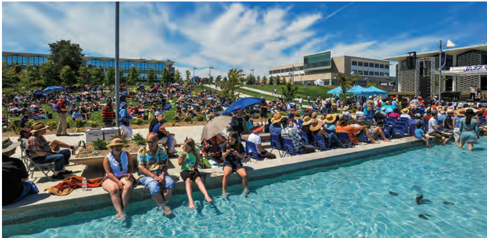
Thousands of jazz fans gather at CSM for the return of Jazz on the Hill last summer.