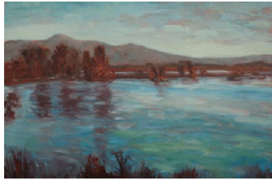
Painting by Gary Crispino

Artwork by members of CSM's Fine Arts Club is currently on display through January 29 at Twin Pines Art Center's Manor House in Belmont. The exhibit displays a wide variety of genres, with works from beginning to advanced student artists. It includes everything from still life and landscapes to portraits and large gallery pieces, most of which are available for sale. The gallery is open to the public Wednesdays through Sundays, 12 to 4 pm.