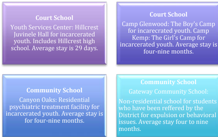
Figure 2: Court and Community School Partnership