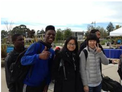
International students stay healthy with fitness classes

All international students at the College of San Mateo are automatically enrolled in a medical health insurance plan purchased at the time of class enrollment. The insurance cost is $648 per semester or $1296 per year. A pre-arrival physical is not required.