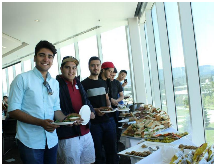
Lunch is provided to new students at orientation