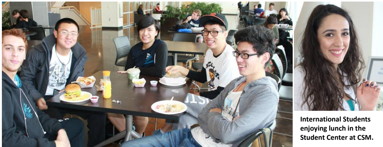
International Students enjoying lunch in the Student Center at CSM.

For more information about fees go to: http://collegeofsanmateo.edu/fees/