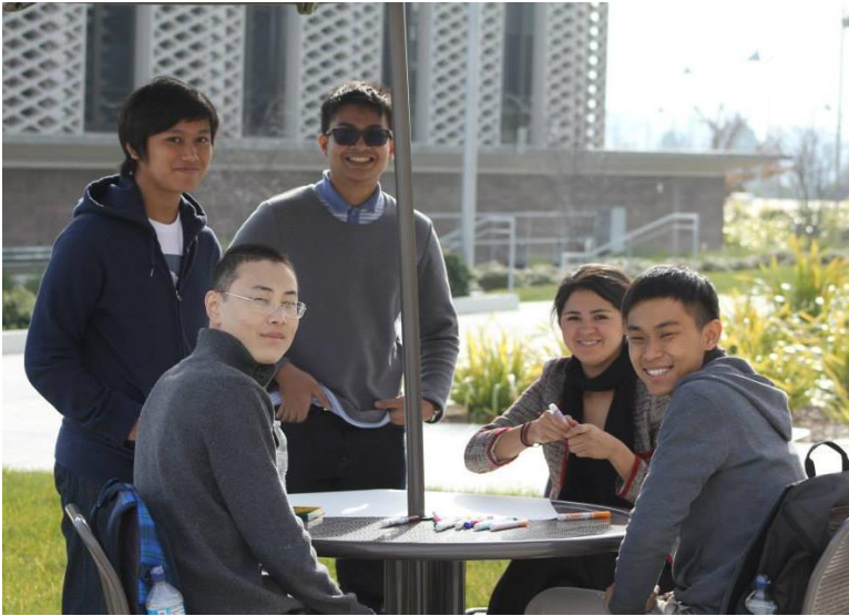
International students making friends at orientation

Our 3-day orientation will welcome you to our campus and provide everything you need to get ready for classes.