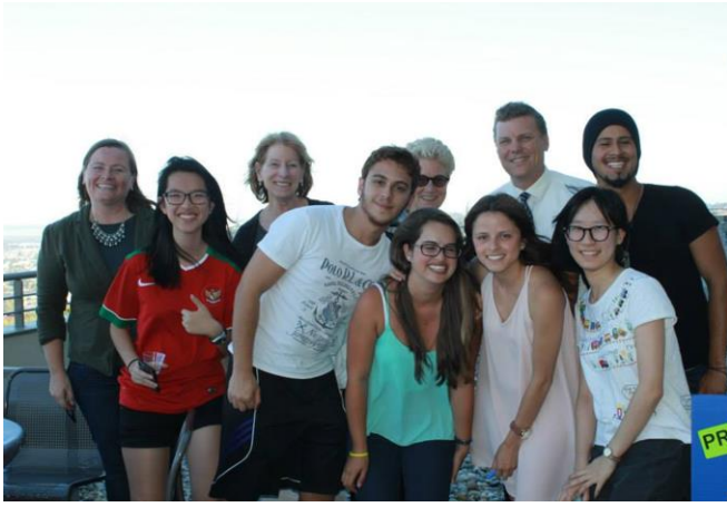
College of San Mateo President Claire and other campus officials celebrate with international students at World Mixer!

Building 10, Room 310 1700 West Hillsdale Boulevard San Mateo, CA 94402 Phone: (650) 574-6525 Fax: (650) 574-6166 Email: csminternational@smccd.edu http://www.collegeofsanmateo.edu/international/