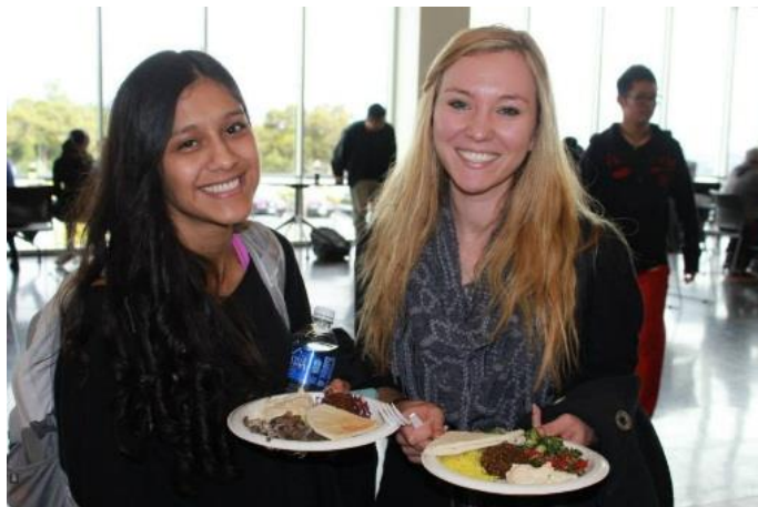
International students enjoying food at a campus event

A lease is a binding legal contract between you and a landlord stating the duration of residence, rent rate, amount of refundable security deposit and apartment rules.