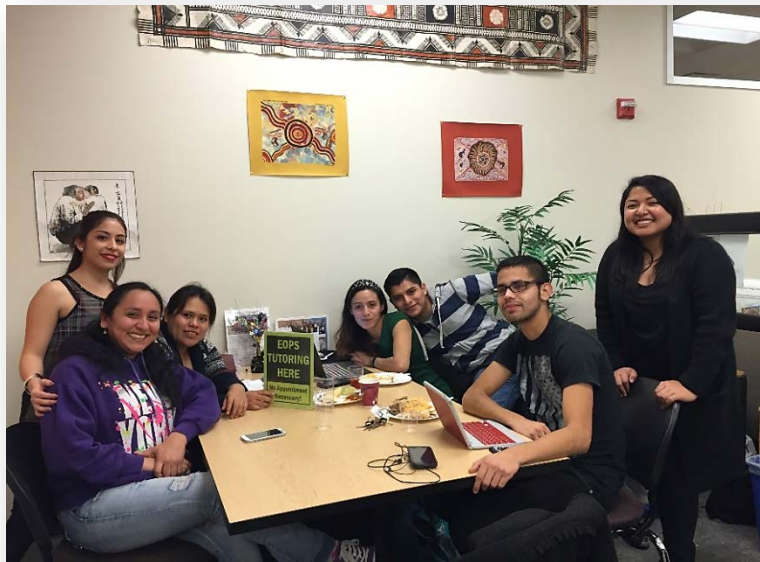
EOPS Program Services Coordinators and EOPS students

For workshop descriptions, 013796 please visit the EOPS website: http://collegeofsanmateo.edu/eops/workshops.asp