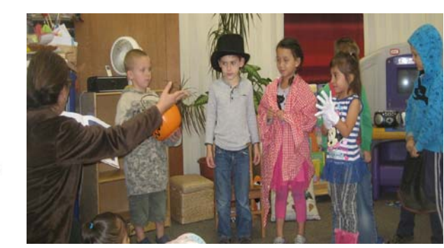
Story dramatization of "The Little Old Lady Who Was Not Afraid of Anything" Clomp, Clomp, Wiggle, Wiggle, Shake, Shake, Clap, Clap, Nod, Nod, Boo, Boo, Boo!!!

different ways. Children learning English and children with special needs are given the opportunity to develop vocabulary appropriate for a variety of situations in a nonthreatening and safe environment. With the help of parents, staff is beginning to collect props to support story dramatizations and finger plays that families can take home to explore. Get ready to take a role & have fun together!