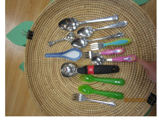
Classroom Collection: Eating Utensils from Our Homes

Research shows that counting collections everyday improves overall school performance. Invite your child to collect 2 or 3 different kinds of small items from around the house or outdoors. Help your child sort them into groups by the type of item. Ask "Which pile has more?" Next, count them together to find out! Then, name the group. High quality mathematics education in preschool is broader than just practicing counting. Children learn math as they explore more and less, make comparisons, and create patterns.