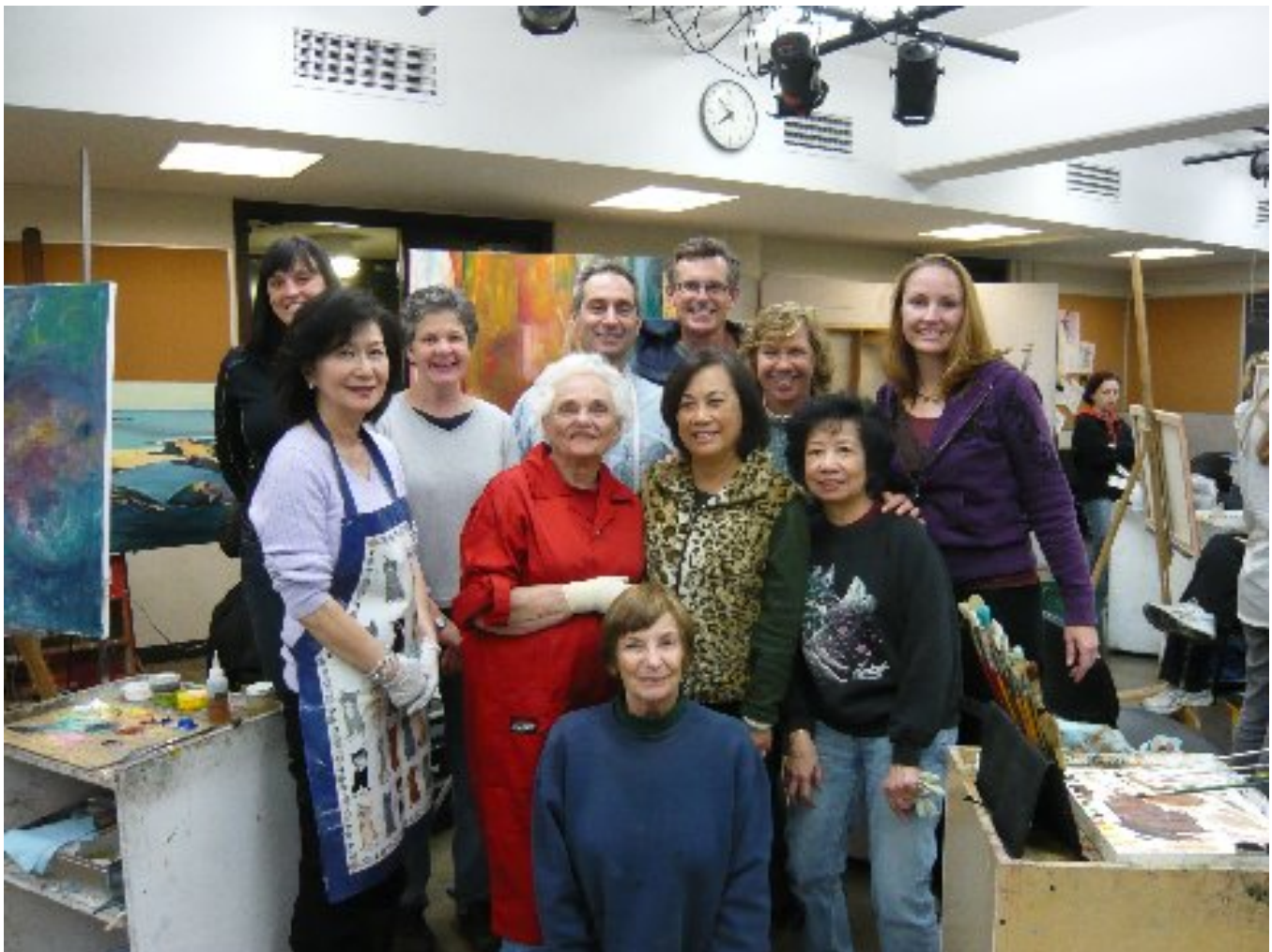
Sanchez Art Center Coastside Invitational Painters from CSM Eve. Oil Painting Class, 2009

"The defining function of the artist is to cherish consciousness." Max Eastman